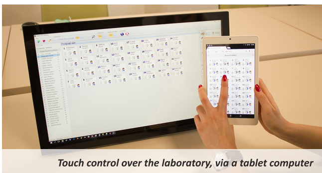
Touch control over the laboratory, via a tablet computer